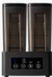
Main body & Wash container