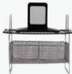
Mesh basket & Jig